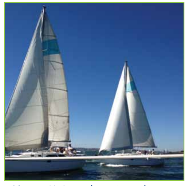
MSCA LIVE 2012 attendees enjoying the open seas during the sailing regatta.

Then, over 100 members got teed off in a good way when they participated in the 21st Annual MSCA Golf Tournament at the Park Hyatt Aviara Resort Golf Club. (See side bar on page 5 for the golf tournament winners.) Many who weren't golfing embarked on a number of other fun activities including a sailing regatta, a wine and beer tasting excursion, and a history-rich tour of the USS Midway. •