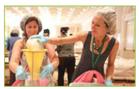
Volunteers busily pack and process bags of rice destined to feed the hungry throughout the world.

In addition, the conference registration area underwent a revamp with the addition of MSCA CENTRAL, a resource center and gathering spot where attendees could do everything from re-charge their electronic devices to set up their own LinkedIn account.